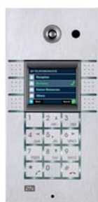
2N® Helios IP Vario

The 2N® Helios IP family is a wide range of door intercoms for every situation - whether in security, business, emergency, or any other special area. From providing simple applications requiring a clear and easy connection to a single IP telephone, to comprehensive communication arrangements integrated into security and signalling systems and IP PBXs. Having the highest quality and certification, 2N ensures compatibility with industry-standard-based IP network solutions such as Avaya, Cisco, and others.