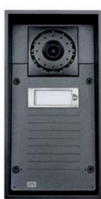
2N® Helios IP Force