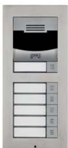
2N® Helios IP Verso